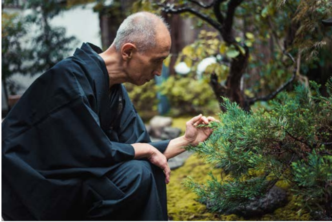
Green tea was an integral part of the traditional Japanese diet and led to health and longevity.