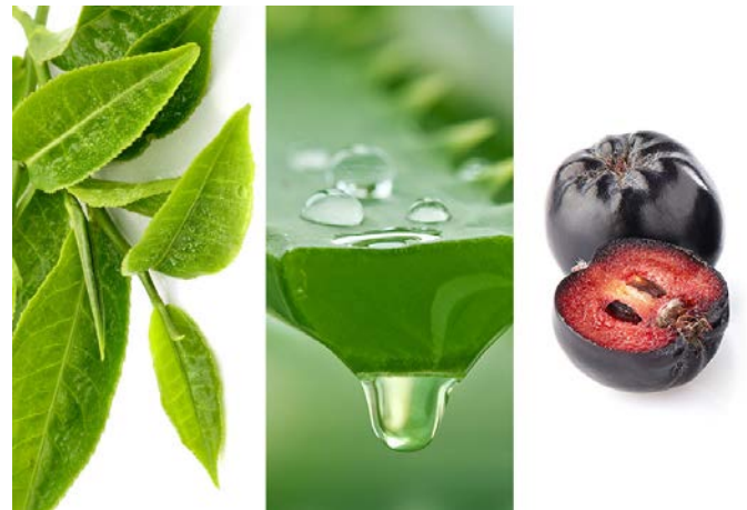
In liquid form, the many active plant substances are more readily bioavailable.

Despite careful and gentle processing, the original vibration of the selected raw materials also inevitably changes during the manufacture of natural products. LavaVitae therefore activates all products with a special natural resonance method, restoring their original vibrational force. As a result, the ingredients are more bioavailable and the organism also benefits from an extraordinary subtle effect.