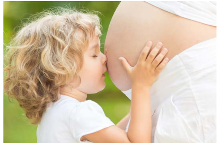
Vita Intense is also an ideal supplement for children and during pregnancy.

Vita Intense is a complete supplement for adults and children. In addition, the concentration of folic acid is especially adapted to requirements during pregnancy. This product is a valuable support for people with increased physical or mental strain as well as athletes. The sweetness of agave syrup also makes Vita Intense suitable for diabetics. All ingredients come from plant sources and are therefore also suitable for people with a vegan lifestyle. The recommended daily dose is a bottle cap and contains a dense concentration of vitamins as well as a variety of exceptional secondary plant substances and antioxidants. Taking a supplement in juice form also has the advantage that the vital substances reach the blood and cells much faster than when consuming dried active ingredients. Vita Intense is therefore the ideal supplement for a healthy diet.